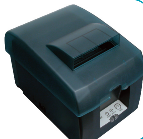
Optional Splash Proof Cover