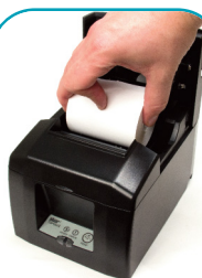
Easy Drop-In & Print