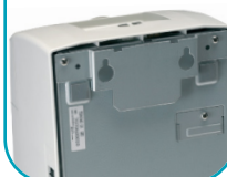
Vertical Wall Mount